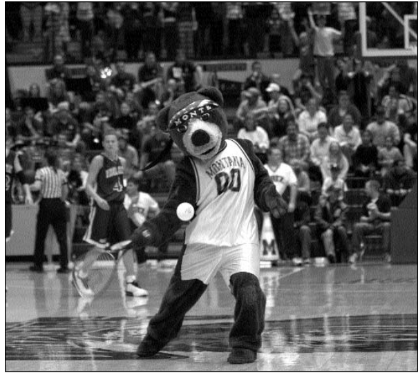
A Crowd Pleaser - Over 3,700 fans per game came out to watch the Lady Griz and their mascot, Monte.

UM entered 2003 with an 8-2 mark, but entered the new year slowly, suffering losses at Western Michigan and Utah, where the Utes got revenge for the Holiday Classic loss by handing the Lady Griz a 77-38 loss, their worst loss since an 89-49 defeat at the hands of Duke on Nov. 26, 1994.